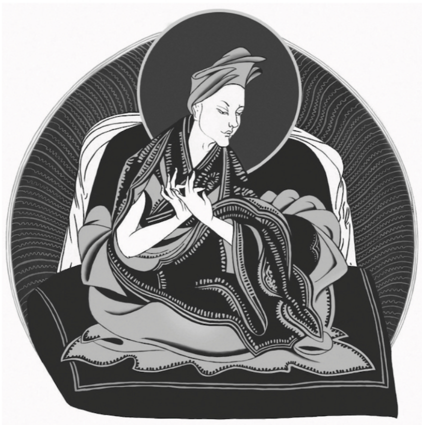
Panchen Lama Losang Chokyi Gyaltsen