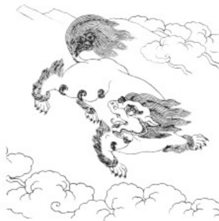
Figure 11—Snow Lion

Details of the practice of the first four Paramitas follow this section.