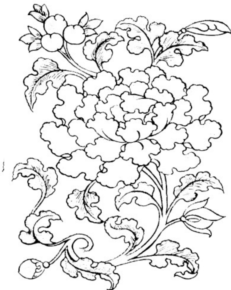
Figure 10—Lotus Flower